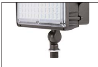
1/2"NPS Knuckle Mount (15W/27W/45W/60W)